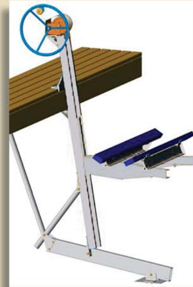
Optional support leg